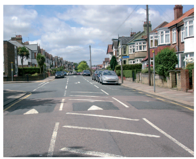
Typical Speed Cushions